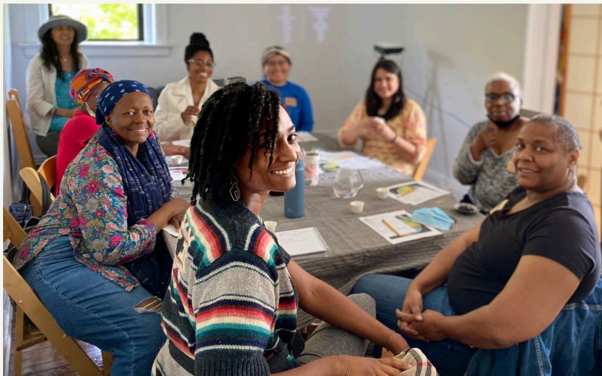
GreenThumb NYCTraining Program 2023