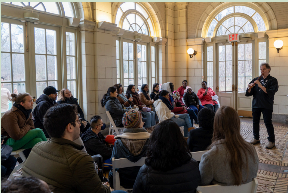
Winter Tea in Prospect Park, Jan 2023