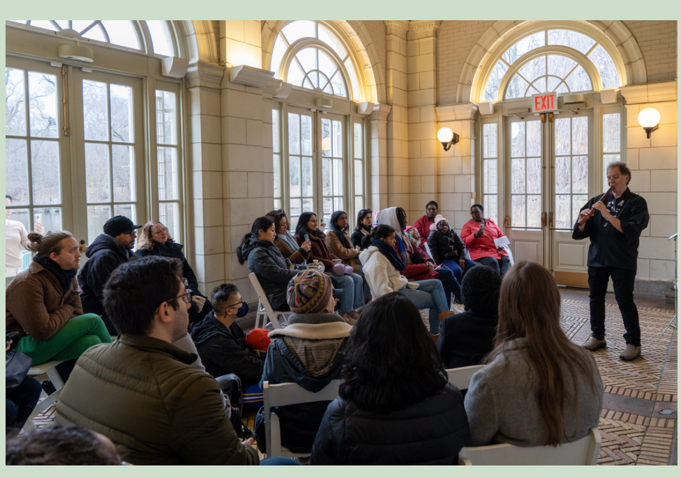
Winter Tea in Prospect Park, Jan 2023