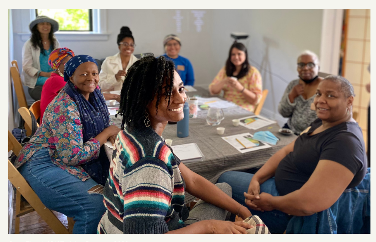
GreenThumb NYCTraining Program 2023